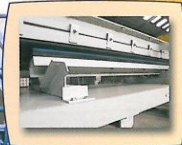
Supply point product