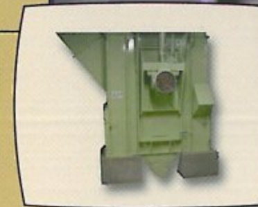
Elevator foot integral cleaning