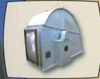
Explosion vent relief