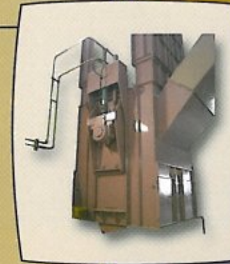
Oil operated tension