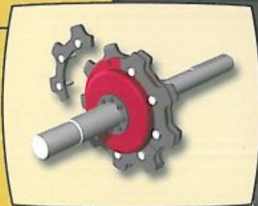
Removable transmission sprocket